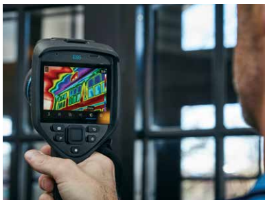
One-handed operation with convenient buttons for safe, streamlined use