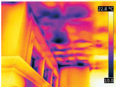
Quickly detect moisture intrusion and building deficiencies